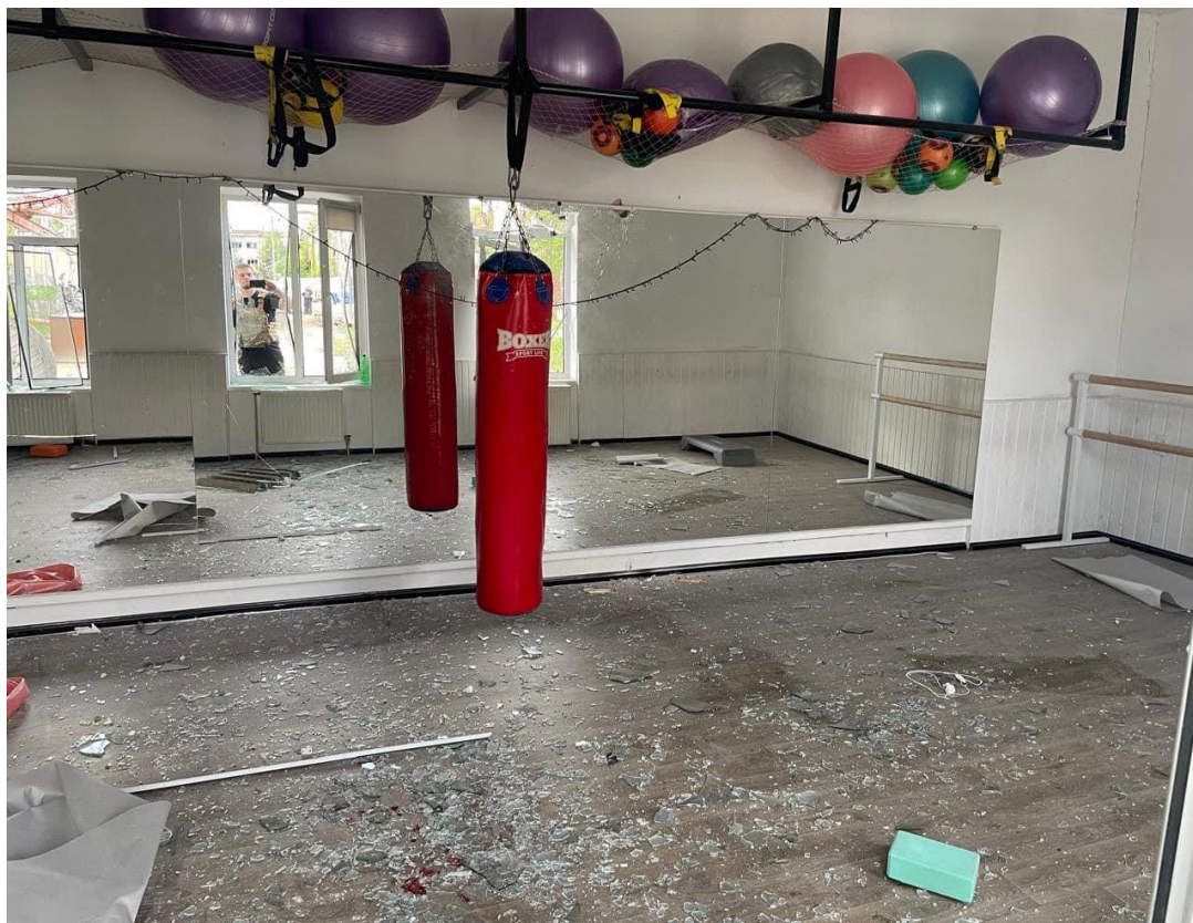
The aftermath of the attack on the sports club in Derhachi, Kharkiv oblast, 2 May 2024.