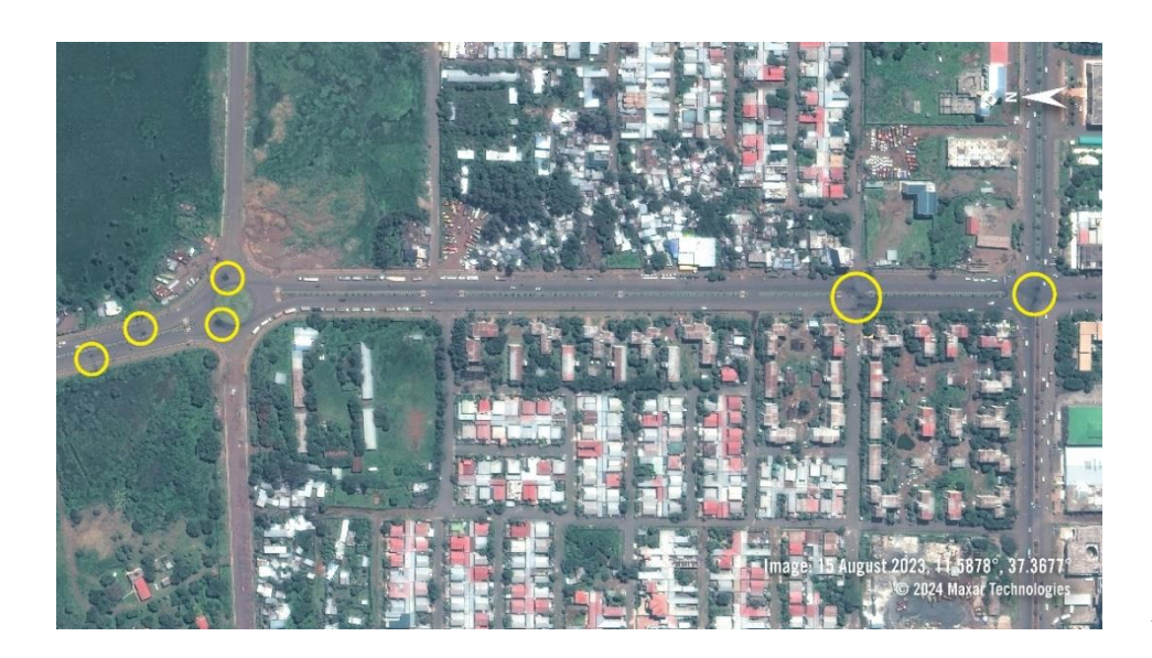
Satellite imagery from 15 August 2023 shows burn marks along a main road in the area of the reported fighting, likely caused by the fires seen in earlier videos.