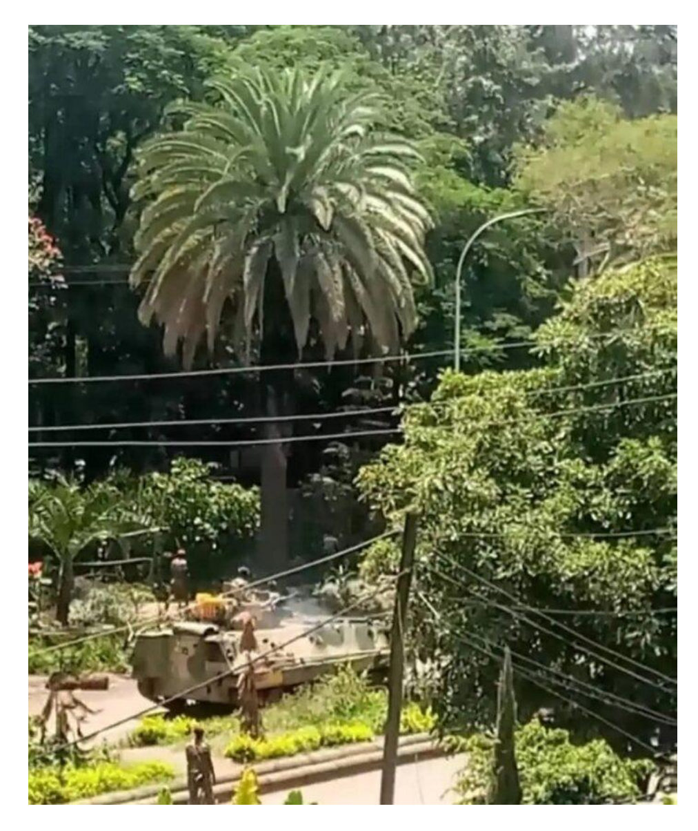
An armoured vehicle is photographed on a street surrounded by trees. Four individuals in military fatigue walk alongside it. 8 August 2023.