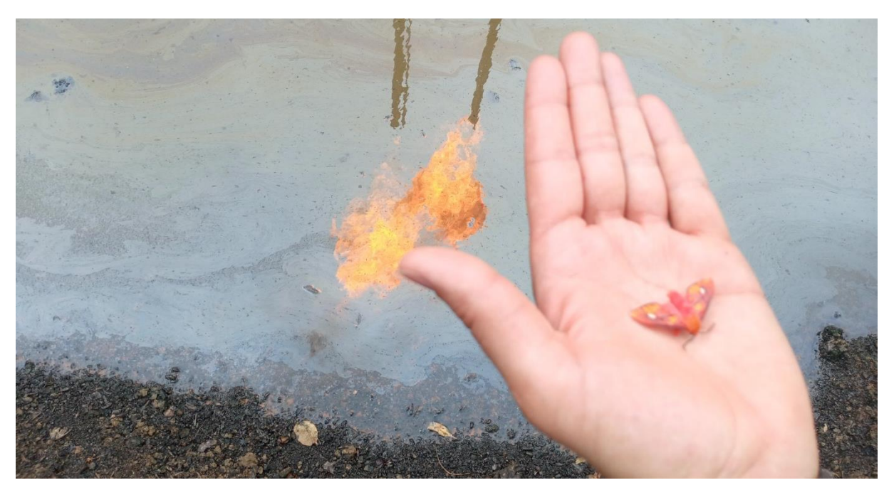
The hand of one of the young women activists holding up an insect against a gas flare

In 2020, a group of nine Ecuadorian child and teenage girls filed a habeas corpus petition ^{125} against the annual State permit allowing the operation of gas flares – the burning of gases associated with oil extraction ^{-126} in the Ecuadorian Amazon provinces of Sucumbíos and Orellana. The petition was filed together with the strategic litigation organization Union of People Affected by Texaco Operations (UDAPT).