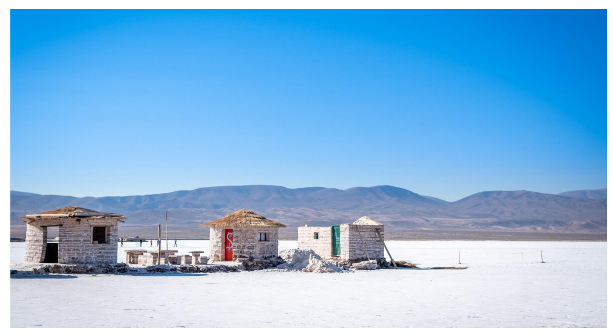
Salinas Grandes, Jujuy, Argentina, 2018

The Kolla and Atakama nations and peoples have lived and cared for the territory of the Salinas Grandes basin and the Guayatayoc Lagoon for generations, with a population of around 7,000 people spread over 33 communities. Twenty-two of them are located in the province of Jujuy and the rest in the province of Salta, in northwestern Argentina, in the part of the altiplano known as Puna, near the border with Chile and Bolivia. Their cosmovision includes an intimate and spiritual relationship with their ancestral territory, which is not only the source of their livelihoods, but also an inextricable part of their history, culture and identity. It is a source of their livelihoods, but also an inextricable part of their history, culture and identity.