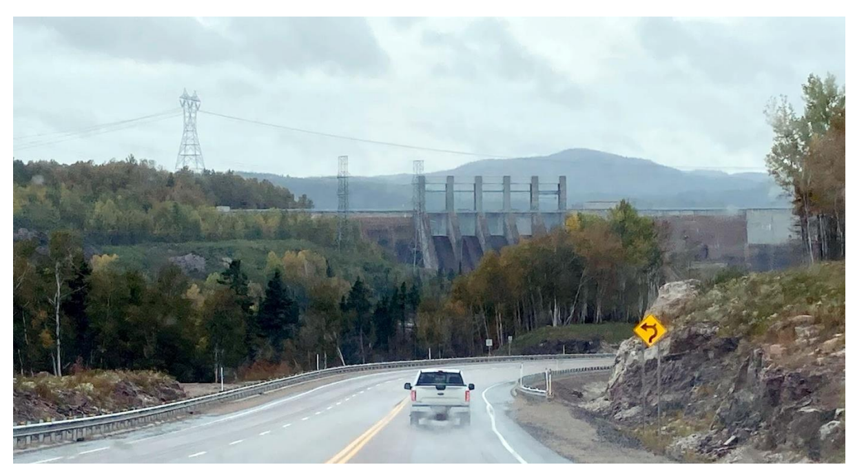
View of a dam in the Pessamit reserve, 2022

Pessamit is an indigenous community of the Innu Nation, located in the Côte-Nord region of the province of Quebec, Canada, at the mouth of the St. Lawrence and Betsiamites Rivers. <sup>211</sup> The reserve, as defined by the Indian Act, <sup>212</sup> covers an area of approximately 256 km2 and has a population of about 4,000 people. <sup>213</sup> However, the Innu's ancestral territory, the Nitassinan, is much larger, spanning around 138,000km2. The Innu have never ceded this territory to either the federal or the provincial governments. In 2005, the Pessamit community began legal proceedings to formally claim their ancestral territory. <sup>214</sup>