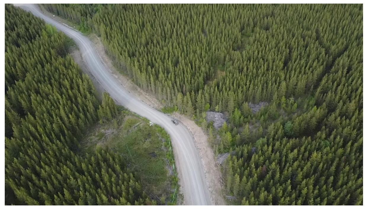
View of Wet'suwet'en territory, 2023

Fossil fuel companies, whether state or private, play a key role in the emissions that drive global warming. According to the Carbon Majors database, 100 existing fossil fuel companies (and eight that no longer exist) have produced almost a trillion tons of GHG emissions in 150 years – more than half of all emissions since the industrial revolution. These 100 companies are responsible for 71% of all GHG emissions since 1988. <sup>10</sup> In the Americas, the private companies responsible for the most emissions during this period, according to the database, are from the United States: ExxonMobil, Chevron and Peabody. The largest emitter amongst state-owned companies in the Americas is Mexican company Pemex, followed by Venezuelan company Petróleos de Venezuela, S.A. <sup>11</sup>