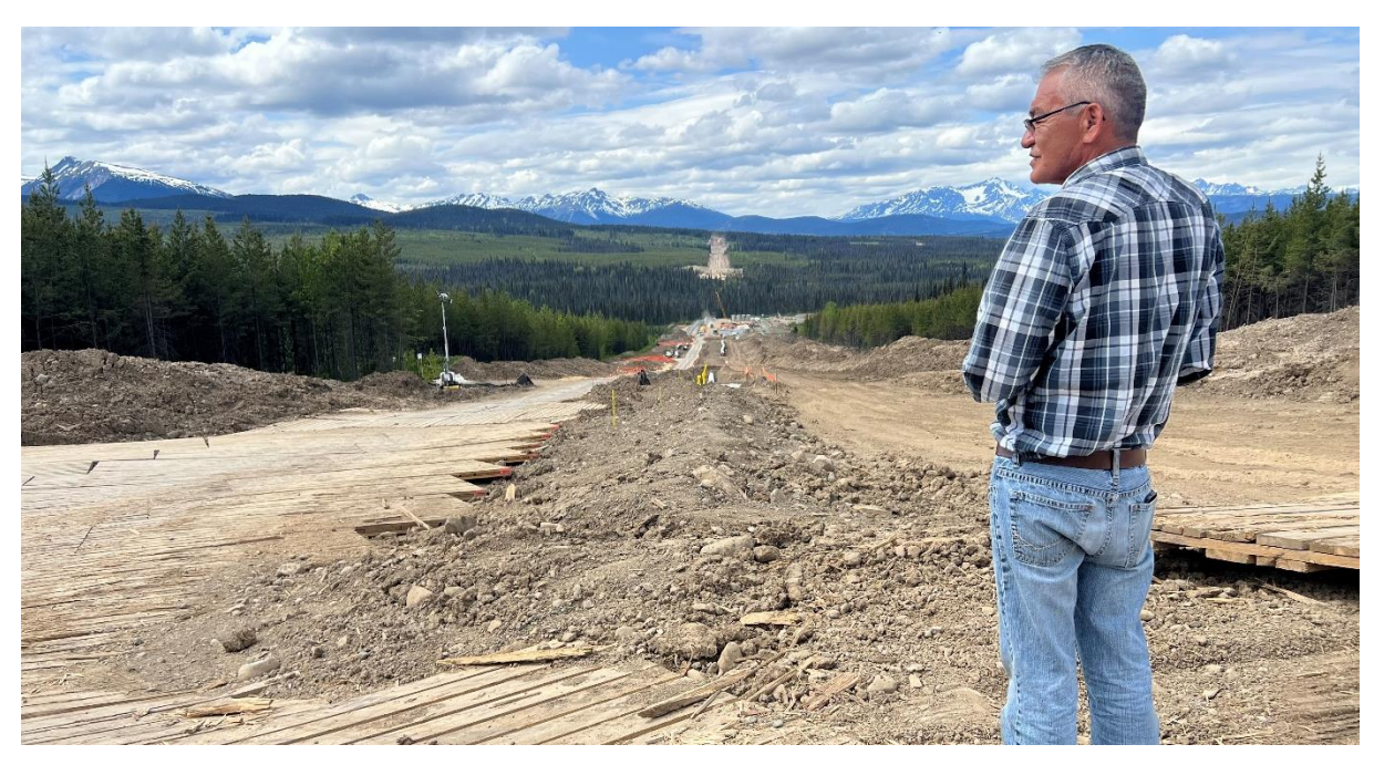
Chief Na'moks of the Wet'suwet'en hereditary chiefs on a building site, 2023

The traditional territory of the Wet'suwet'en nation is divided into five clans – Gilseyhu, Laksilyu, Gitdumden, Laksamshu and Tsayu – and 13 groups of matrilineal house groups. Collective decisions are made through the feast system, which remains central to Wet'suwet'en government, law, social structure and world view. The Wet'suwet'en have never sold, surrendered or in any way relinquished their collective title to their territories. They have continued to exercise their unbroken, unextinguishable and unceded right to govern and occupy their lands. Hereditary chief Gisday'wa stated that "our territory, our river and our mountains are sacred to us". Other members of the nation stated that "[our territory] is part of who we are as an Indigenous People" and that "the Wet'suwet'en do not own the land; we are simply caretakers for the next generation. We have a duty to the land, the animals, the water, everything that sustains us. The Earth can survive without us, but we cannot survive without the Earth".