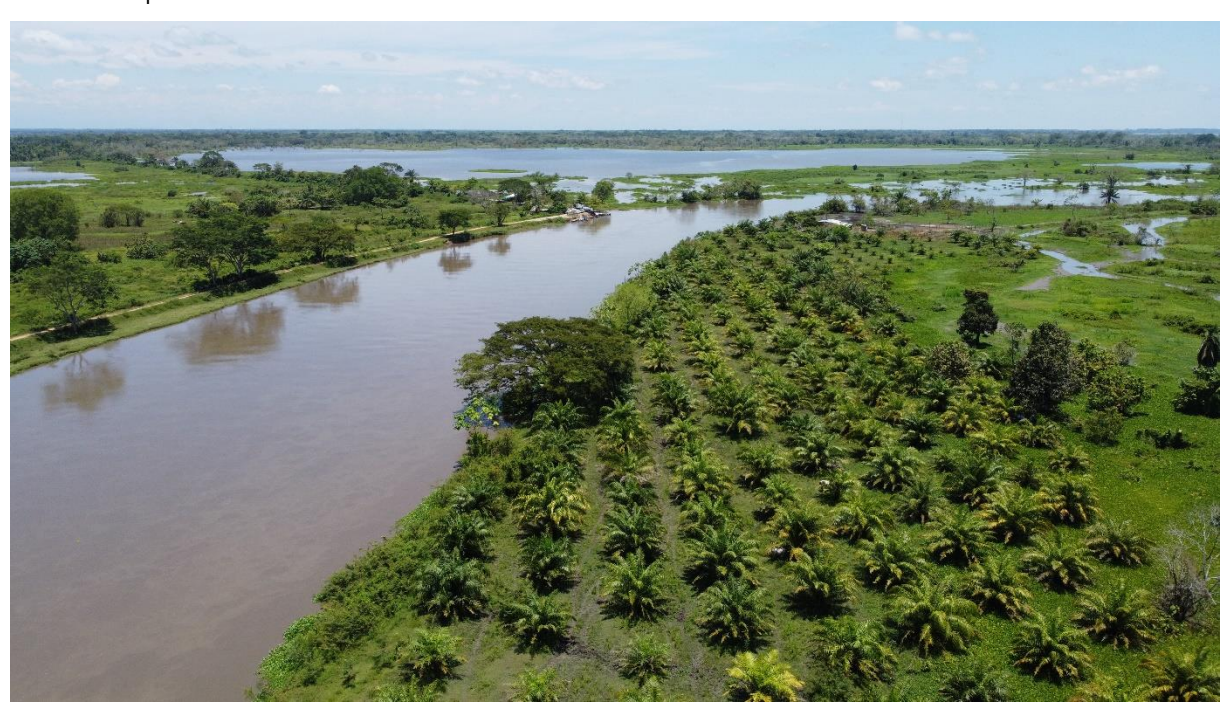
View of bodies of water in the Magdalena Medio, Santander, Colombia, 2022

Wetlands of International Importance (Ramsar sites) in the Americas.<sup>40</sup> Latin America and the Caribbean is one of the regions where a more widespread deterioration in the state of these ecosystems has been reported.41