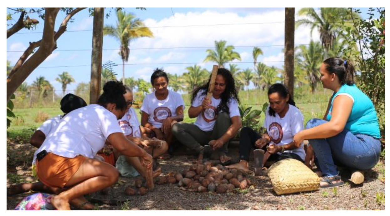
Members of the Maranhão Women's Network breaking babassu coconuts, 2023

The Maranhão Women's Network (Rede Mulheres do Maranhão, RMM) cooperative is made up of 15 communities located along the Carajás railway line. The network is coordinated by 12 women and 15 business associations, benefiting a total of 200 women from the region. Among them, there are four groups of coconut breakers who extract the coconut flesh and several factories producing oil, soap, sweets and other products from the coconuts.