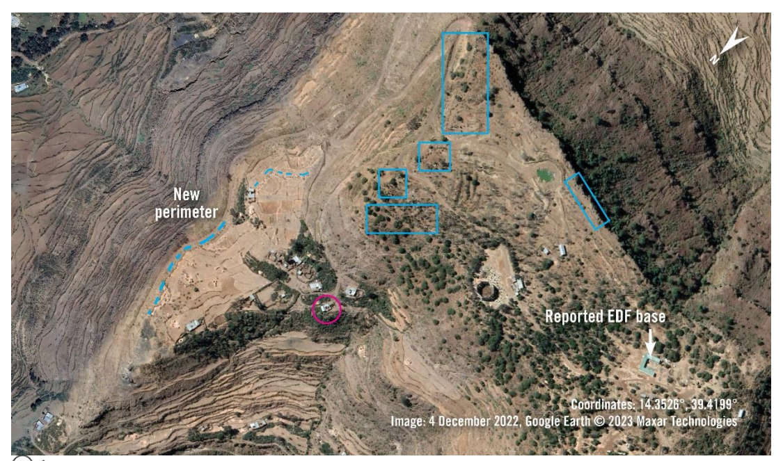
**Cokob Tsibah District: Satellite imagery shows that many new structures - highlighted with blue boxes - have appeared between 28 March 2022 and 4 December 2022 close to the reported EDF military base. New perimeters are also visible. One damaged structure is visible - highlighted with a red circle.

an interview with a social worker, the women were targeted on suspicion of having relatives or partners in the Tigrayan forces.<sup>51</sup>