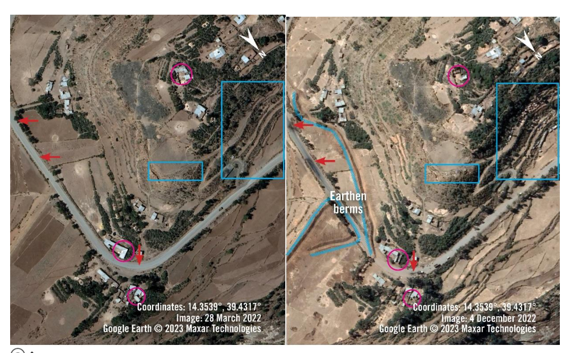
(Solution Continuous) November 2022. New machine-built earthen berms are also visible. Red arrows show burn scars on the road from destroyed vehicles and red circles highlight three structures that appear damaged or destroyed. The vehicles were destroyed between 2-3 November 2022, according to satellite imagery (not shown).

Four residents of Kokob Tsibah district told Amnesty International that they had witnessed the EDF kill civilians at close range between 1 November 2022 and 19 January 2023, primarily in early November. The four residents witnessed the killing of three people between the age of 40 and 70, including one priest. 114