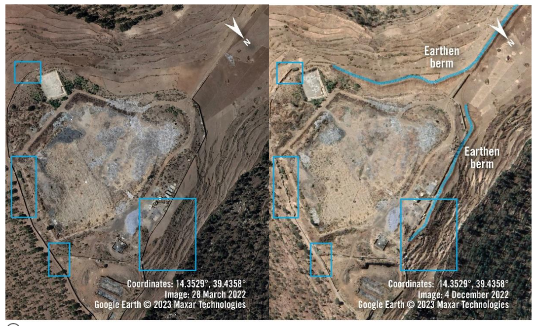
Satellite imagery shows that many new structures - highlighted with blue boxes - have appeared between 28 March 2022 and 4 December 2022. New machine-built earthen berms are also visible. Red arrows show burn scars on the road from destroyed vehicles and red circles highlight three structures that appear damaged or destroyed. The vehicles were destroyed between 2-3 November 2022, according to satellite imagery (not shown).

This was not the first time that Kokob Tsibah fell under the EDF's control. Previously, it had been held by the EDF for seven months from 21 November 2020 to 28 June 2021, according to a social worker. During this time, nearby towns had also been under EDF's control, and the social worker said that made it extremely difficult for survivors to get medical support at the nearest available heath centers.<sup>37</sup> The social worker told Amnesty International that, during this earlier period, around 120 women had reported to their organization that they had been subjected to sexual violence by members of the EDF.