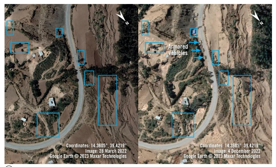
↑ Kokob Tsibah District: Satellite imagery shows many new structures - highlighted with blue boxes - have appeared between 28 March 2022 and 4 December 2022. Armored vehicles are visible along the main road.