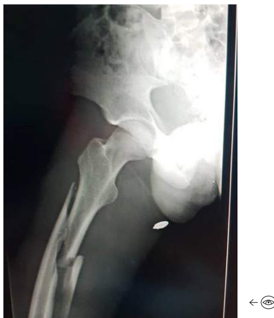
M.A.X.'s X-ray taken at the Dr. José María Benítez de la Victoria Hospital, January 2019.

The jurisprudence of the Inter-American Court has established that, in addition to the absolute demonstrable necessity of using lethal force, its use must be proportionate to the level of resistance offered at any given moment and “the level of cooperation, resistance, or aggressiveness” in order to “use tactics of negotiation, control or use of force, as appropriate”. 114 The details of this case indicate that the GNB used lethal force almost immediately, in order to enable road traffic to circulate and when the blockade posed no risk or threat to the lives of the officials.